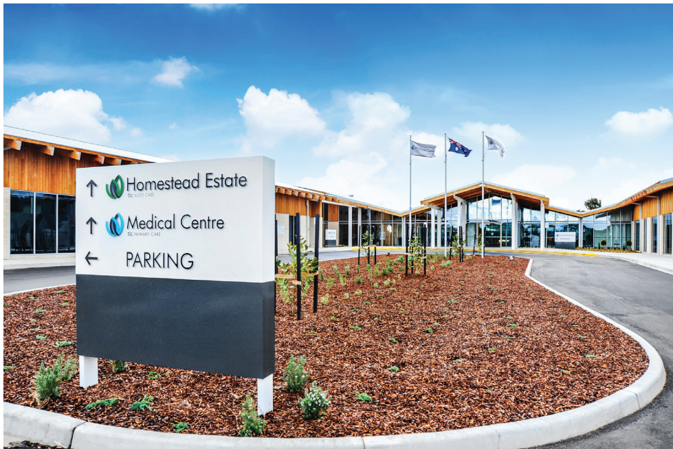
The medical centre offers general practitioner consultations, physiotherapy, podiatry, dietetics, hydrotherapy chronic disease management and nursing services.